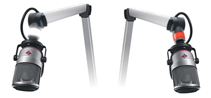
M!KA is a registered trademark of Yellowtec GmbH. M!KA mic arm shown courtesy Yellowtec GmbH.

You splurged. You bought gorgeous new M!KA microphone arms for the studio. And you got the ones with the tally lights. Good thinking. In the Smartphone era, guests get distracted. You need a way to get their attention and the mic arm tally lights are um, brilliant.